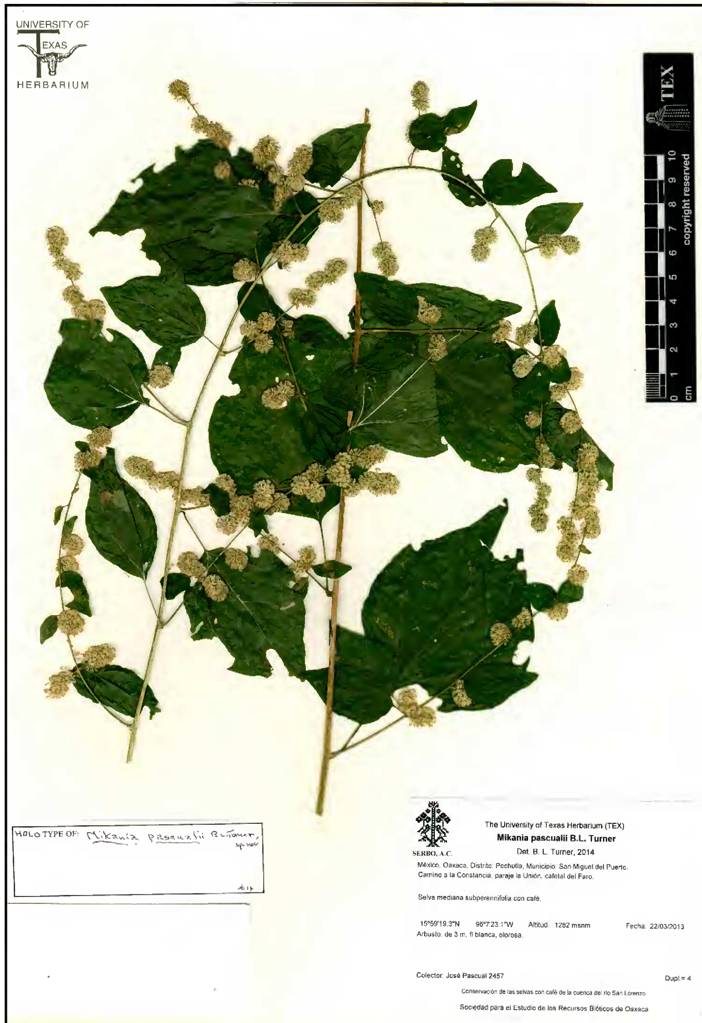
Fig. 1. Mikania pascualii (Holotype: TEX).